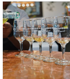
DH Lescombes Winery & Bistro