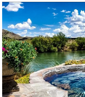
Riverbend Hotsprings, T or C, NM