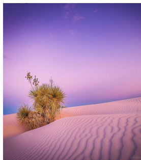
White Sands National Park