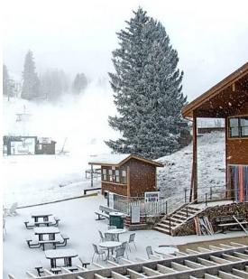
Ski Apache, Ruidoso, NM