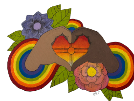
Nuestra Juventud Logo

We look forward to continued collaboration with our clients, families, community, and strategic partners to live and strengthen our purpose!